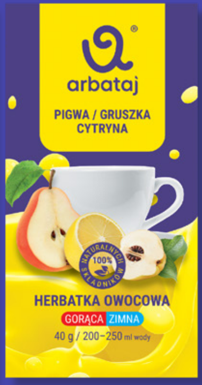
Fruit and berry mix for preparing PEAR & LEMON drink