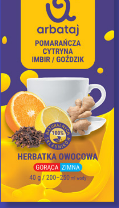
Fruit and berry mix for preparing ORANGE & CLOVES drink