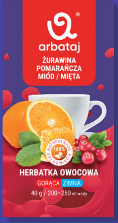
Fruit and berry mix for preparing CRANBERRY & MINT drink