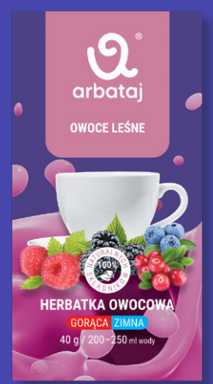
Fruit and berry mix for preparing FOREST BERRIES drink