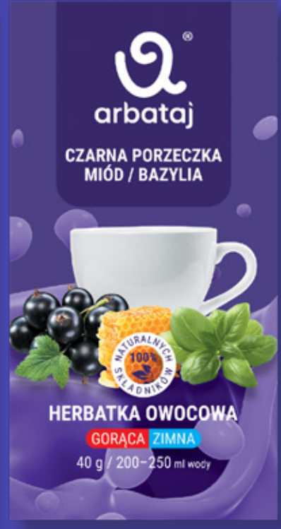
Fruit and berry mix for preparing CURRANT & BASIL drink