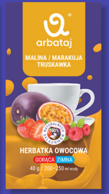
Fruit and berry mix for preparing PASSION FRUIT & STRAWBERRY drink