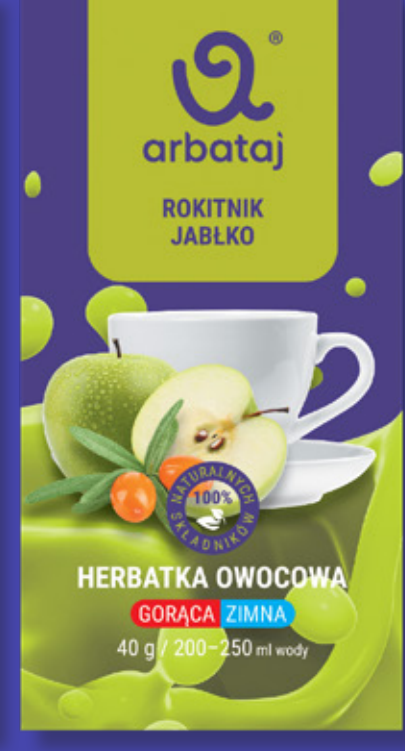
Fruit and berry mix for preparing BUCKTHORN & APPLE drink