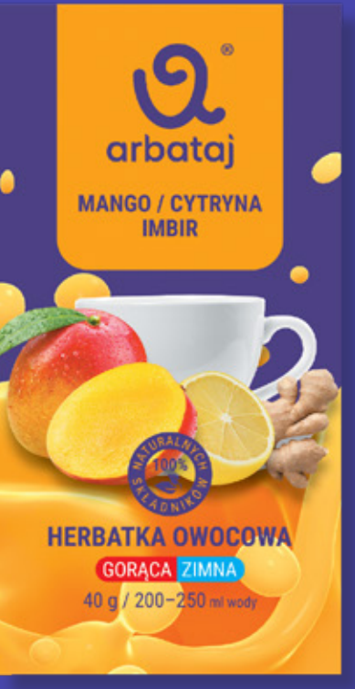
Fruit and berry mix for preparing MANGO & GINGER drink